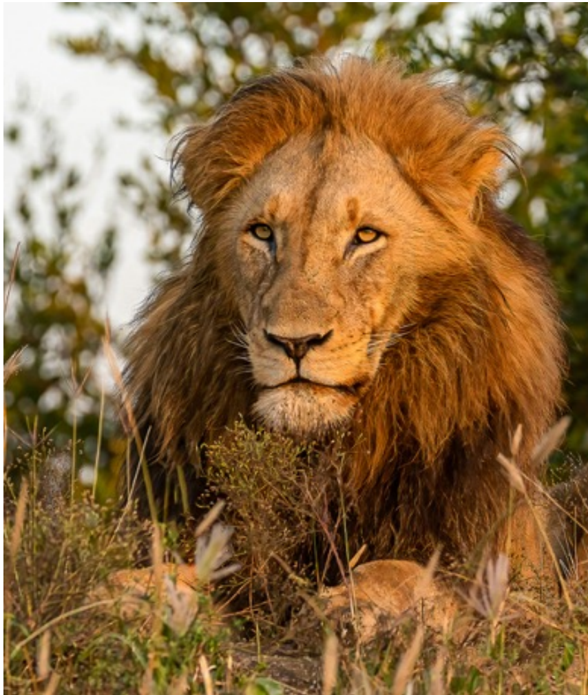
Othawa male 2021

I love Elephants – everything about them and especially the little calves. Their family bond is admirable, their strength undeniable, their family dynamics unbelievable. I was fortunate to witness this mom and baby, probably just a week or so after its birth. After birth, the calves stay very close to their moms as they are not very stable on their feet until 3-4 days after birth. Mom provides a wall to support the little one.