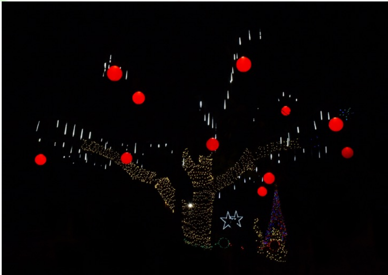
A different kind of Christmas Tree – Jane Postiglione