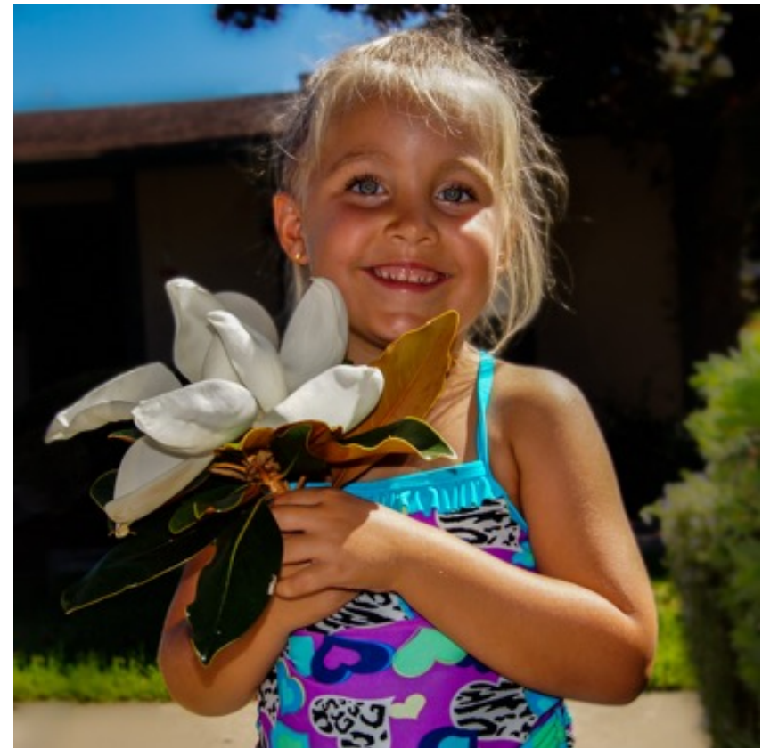
Happiness - David Morse