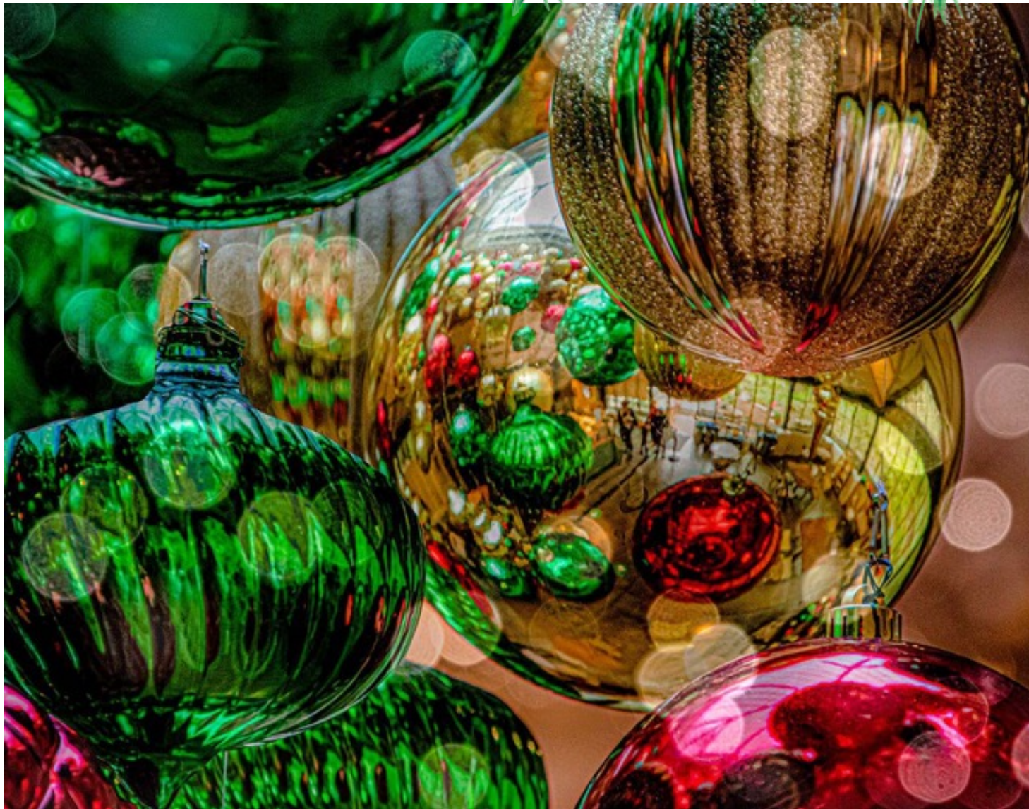
Reflections of the Season – Peggy Fleming