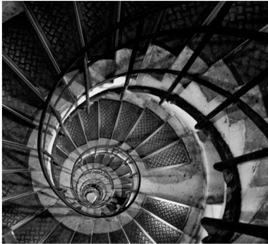
Iron nautilus

the Contra Costa Camera Club is a member of the Northern California Council of Camera Clubs-N4C and the Photographic Society of America-PSA