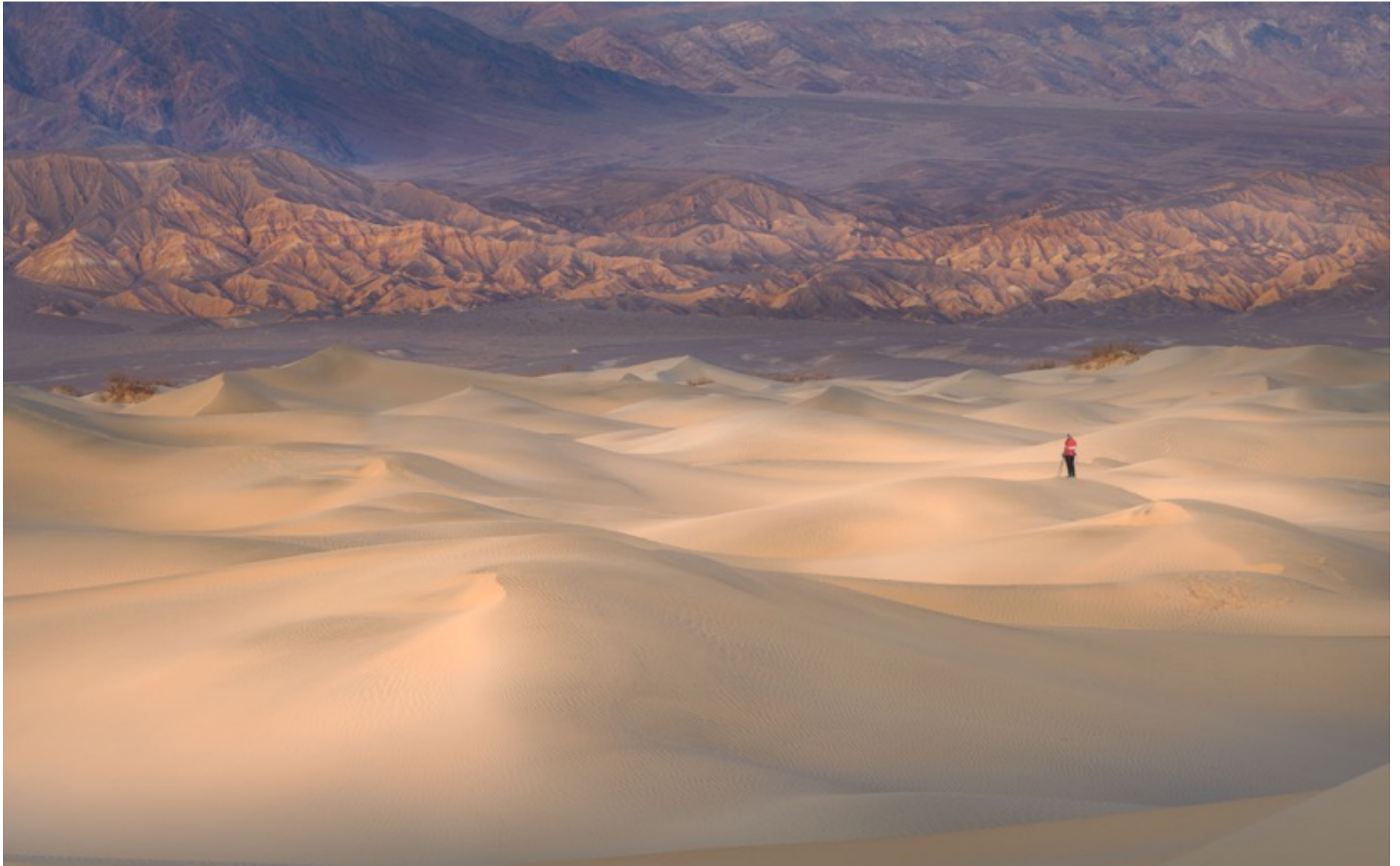
Alone - San Yuan