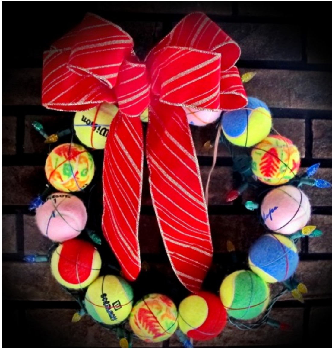
Tennis Player's Wreath – Meng Horng