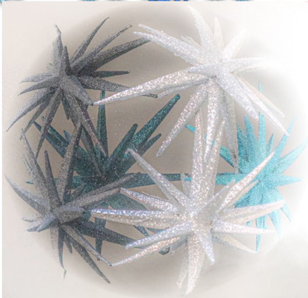
Peace and Light