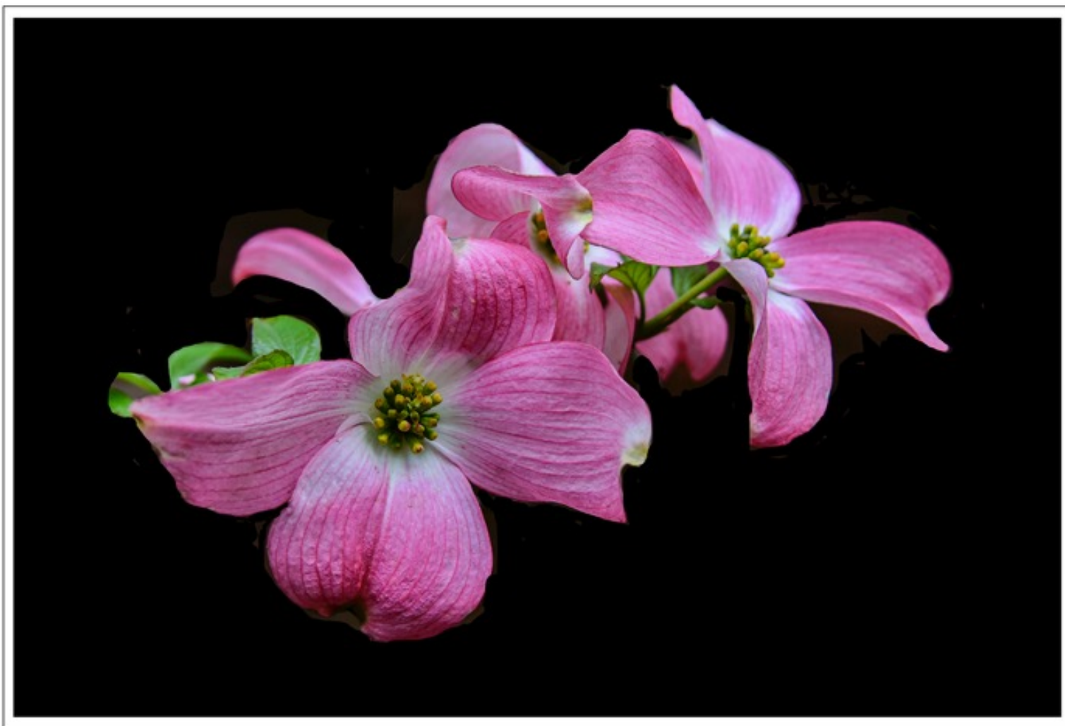
Pink Dogwood with black background and border - Joan Field