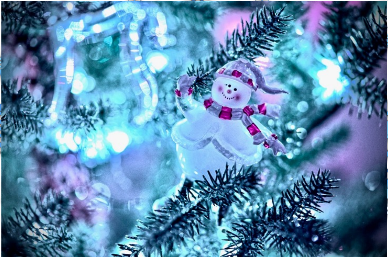
Frosty the Snowman