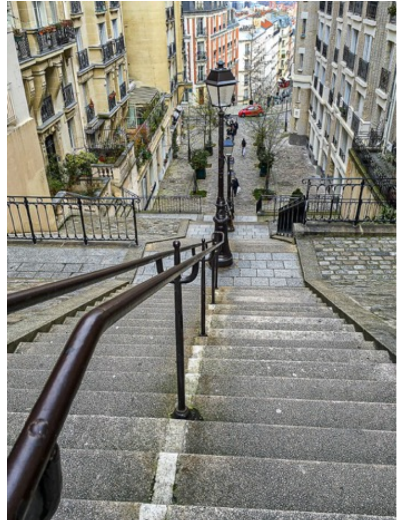
Steps in Montmartre

Paris is truly the City of Lights as evidenced by my photo of the Pyramid/Louvre taken near midnight during the summer. I know Paris as well as SF and so was comfortable to walk there before sunset so I could get some interesting shots, but as the evening moved on, and the crowds disappeared, I began to move around the Pyramid to see what kind of images I could capture. This was my favorite