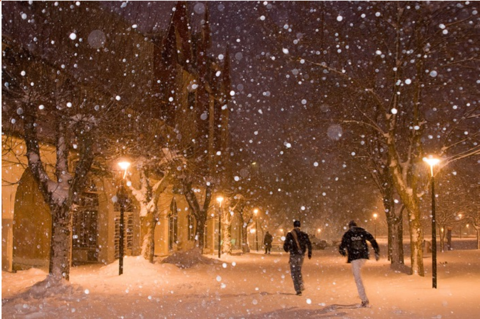
Dashing Through The Snow