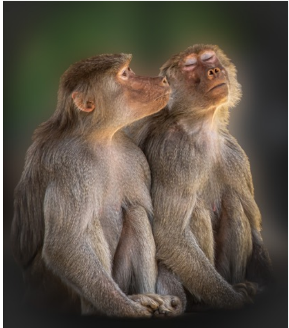
Oh..sing to me! - Peggy Fleming