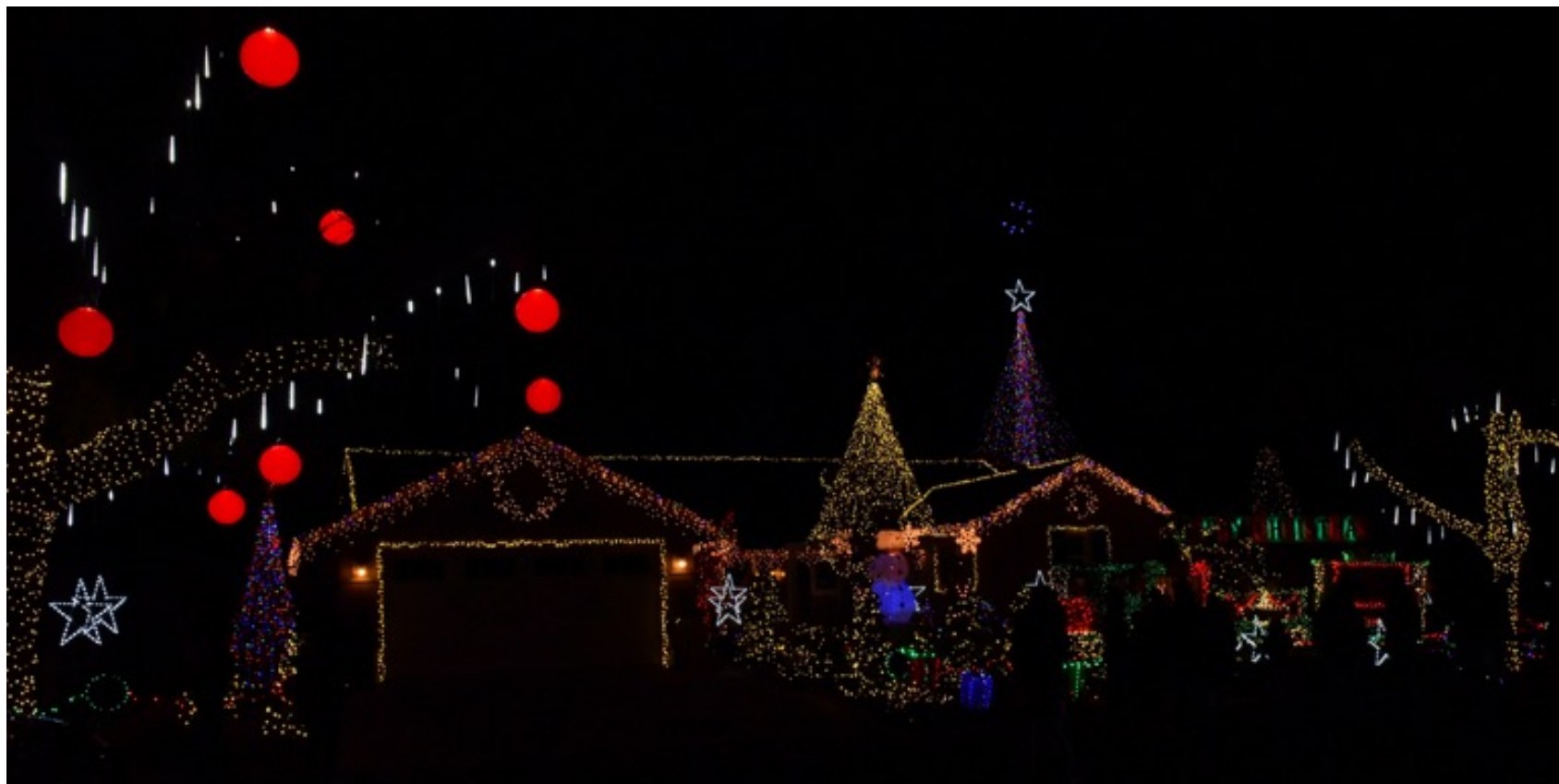
Walnut Creek House Lights – Jane Postiglione