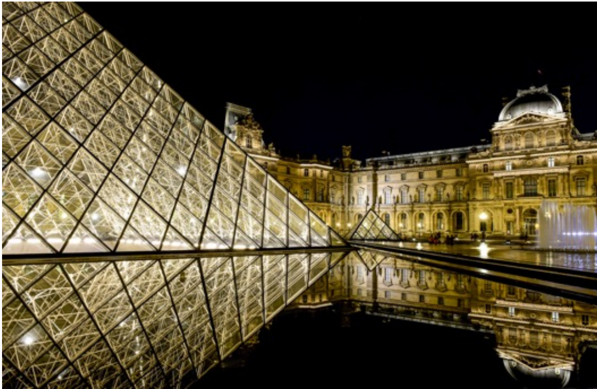
One of the iconic landmarks of Paris, the Louvre is especially alluring at night

Paris is truly the City of Lights as evidenced by my photo of the Pyramid/Louvre taken near midnight during the summer. I know Paris as well as SF and so was comfortable to walk there before sunset so I could get some interesting shots, but as the evening moved on, and the crowds disappeared, I began to move around the Pyramid to see what kind of images I could capture. This was my favorite