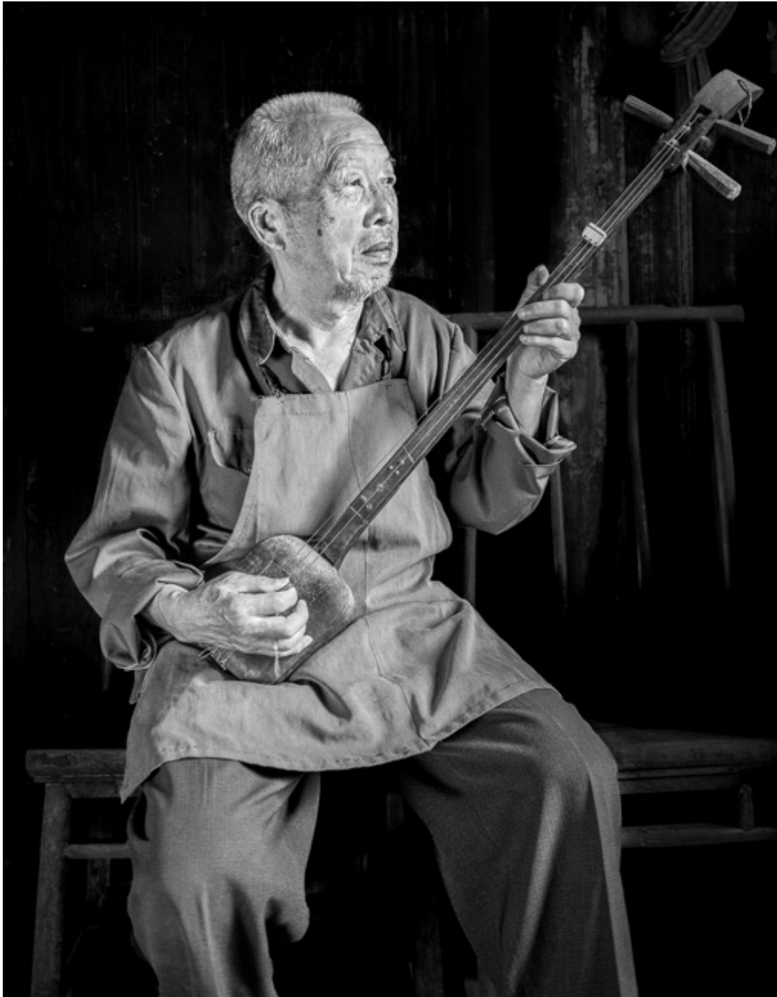
Elder Chinese man carrying on an ancient tradition of his ancestors playing an authentic sanxian