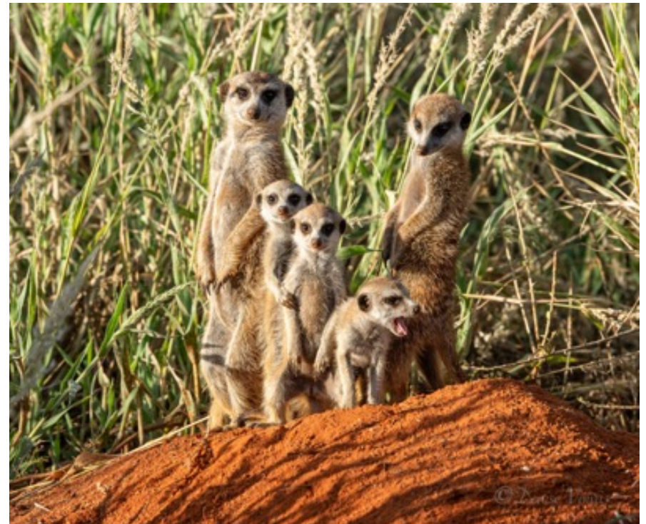
Meerkat family portrait

Meerkats are not easily found in Africa, so I traveled to the Northern Kalahari in South Africa, to a private game reserve that is home to two families of Meerkats. This family I photographed early one morning is part of the McCulloch clan, at the time about 17 members. I love this family photo because it is so imperfect – the one little one not behaving with mom looking at him with the evil eye.