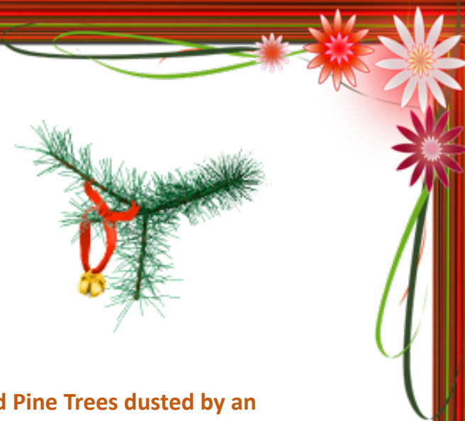
Aspen and Pine Trees dusted by an Early Snow, Colorado – Pat Prettie