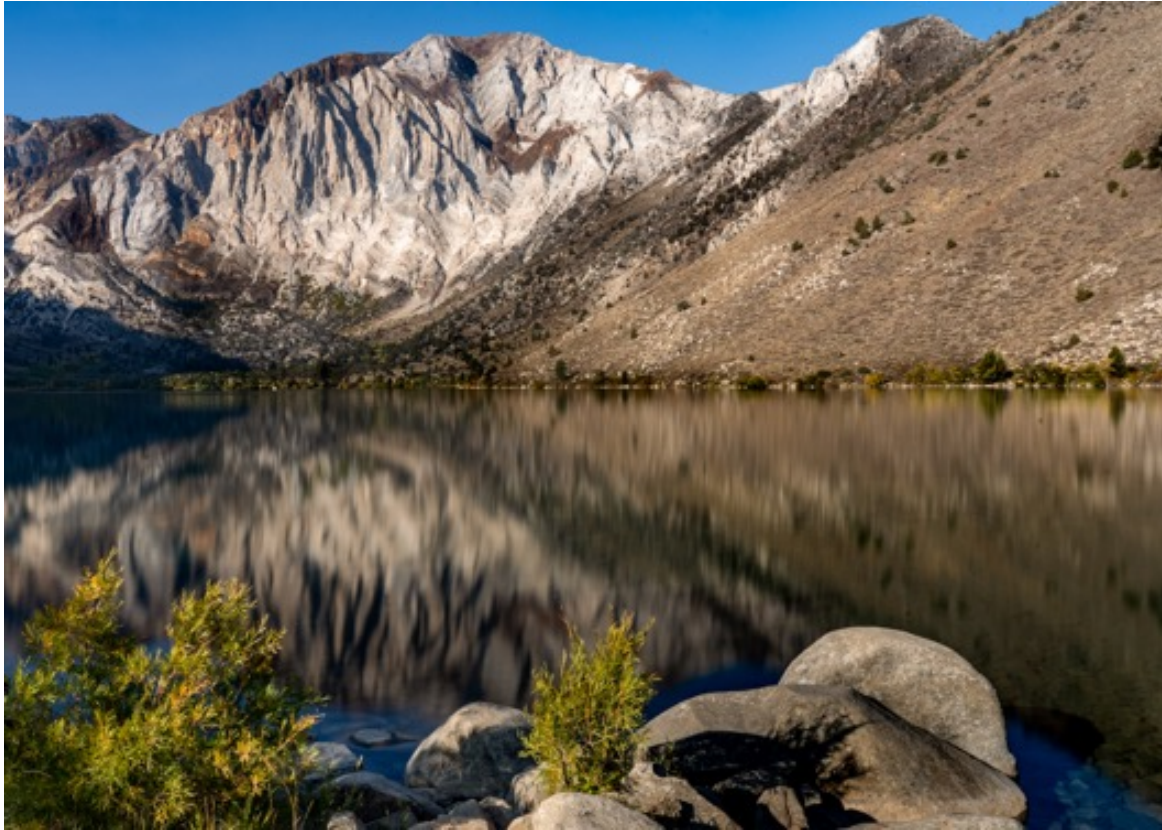
Early morning at Convict Lake - Sandy Eger