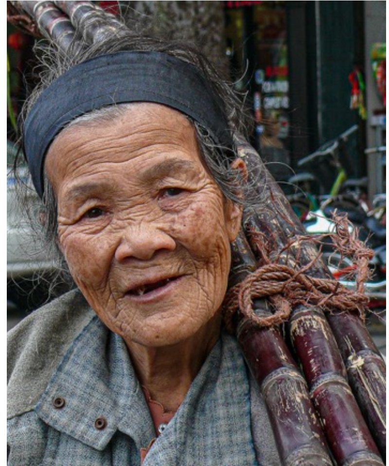
Vintage Vietnamese woman

Paris is a walking city and from my rented apartment, I covered at least 2 to 3 arrondissements a day. This café is just over the bridge to Ile Ste. Louis from Notre Dame. I took it mid-morning because the light was good and there were some interesting customers.