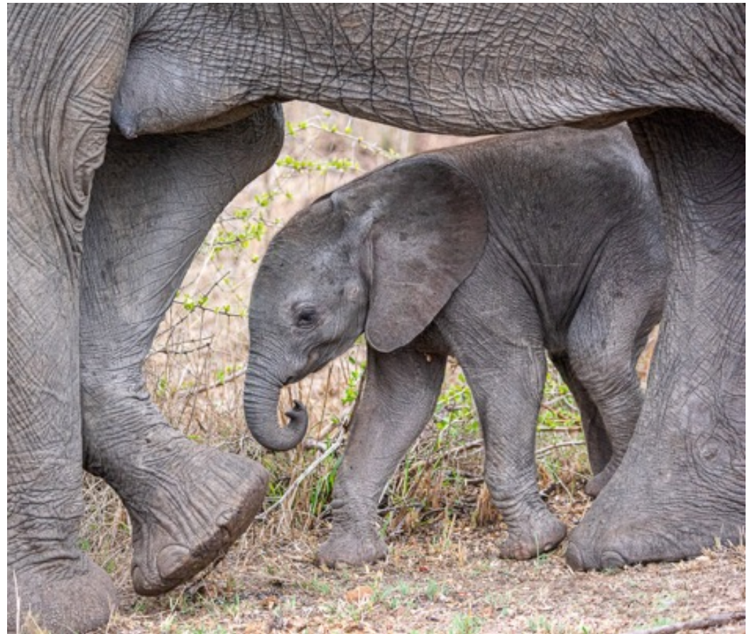
Sheltering under mom